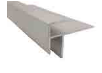
Alpine Plank End Trim